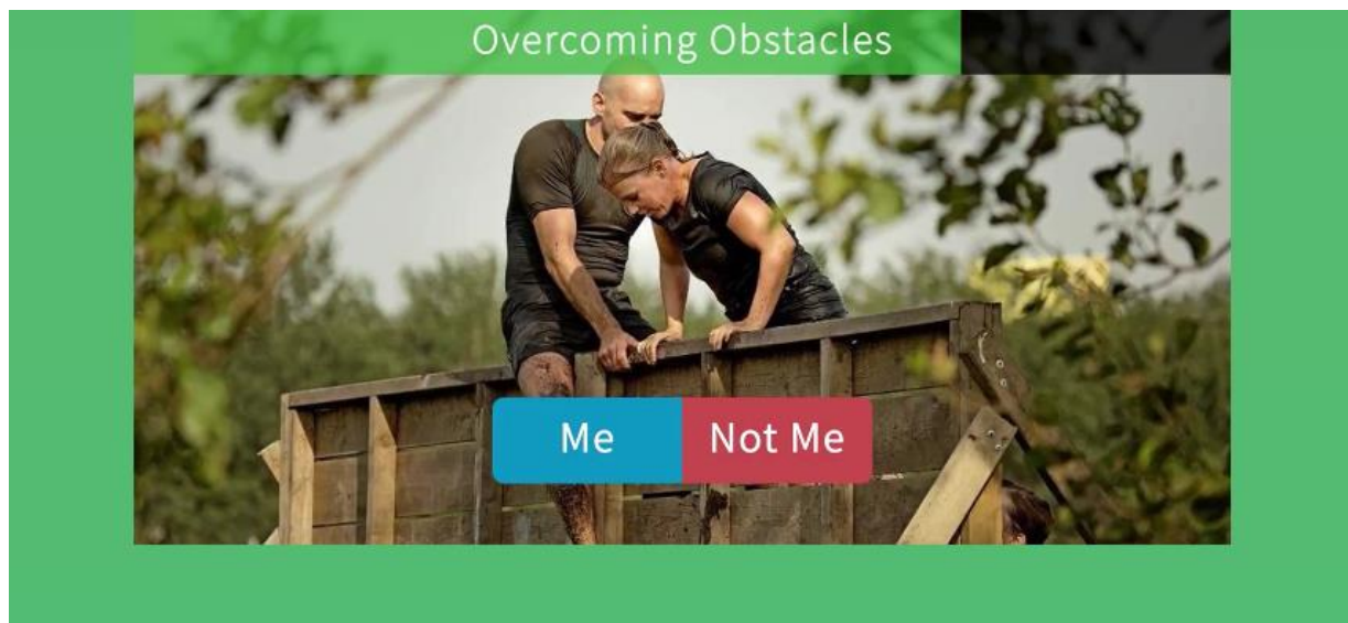
Figure 2: Screen capture of test that measures the Big Five traits against the Holland Interest models, November 24, 2020

Employers using these hiring tools must provide reasonable accommodations to applicants with disabilities. 24 If an alternative version of the algorithm-driven test is not available, employers are required to accommodate the applicant with some other way of measuring their fitness for the job. This could be as simple as conducting a live interview, accepting written statements or answers, reading aloud a written employment test, or allowing or providing an interpreter or similar assistance. 25 Employers must be aware of these requirements, make clear to candidates that alternative testing is available, and treat candidates who request accommodations equally.